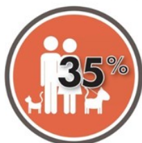
PET OWNERSHIP BY GENERATION (2017)

E-commerce offers many benefits to pet owners like customized products and the convenience of home delivery. As millennials continue to educate themselves about their pets, we can expect to see more online activity and growth in pet food sales.